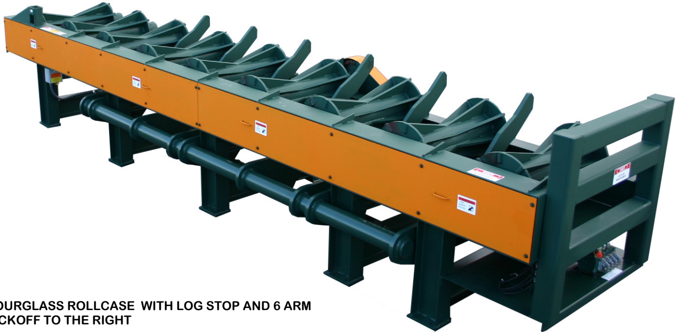
HOURGLASS ROLLCASE WITH LOG STOP AND 6 ARM KICKOFF TO THE RIGHT