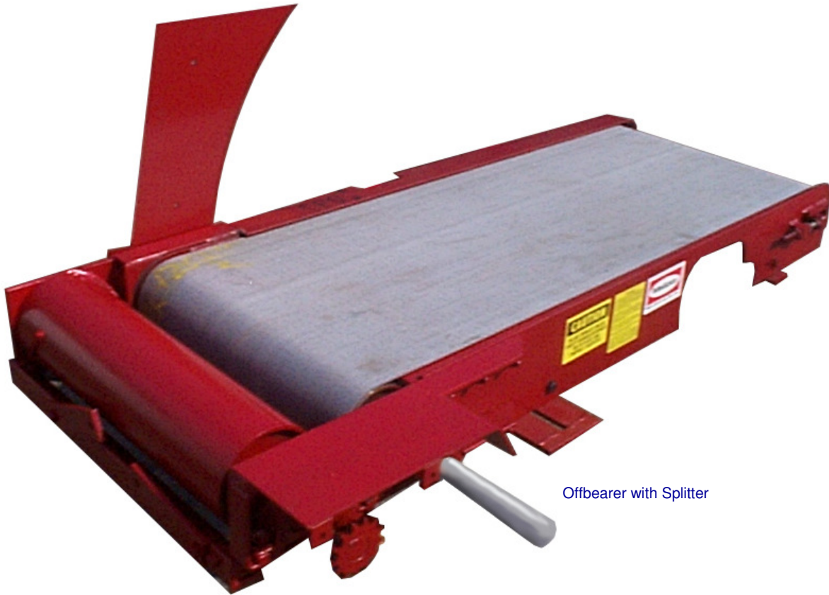
Offbearer with Splitter