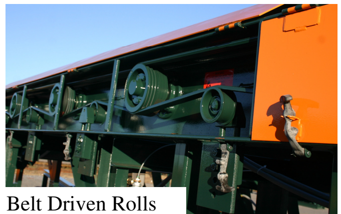
Belt Driven Rolls