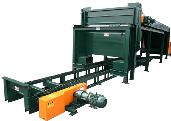
Custom built transfers and optional stick carts