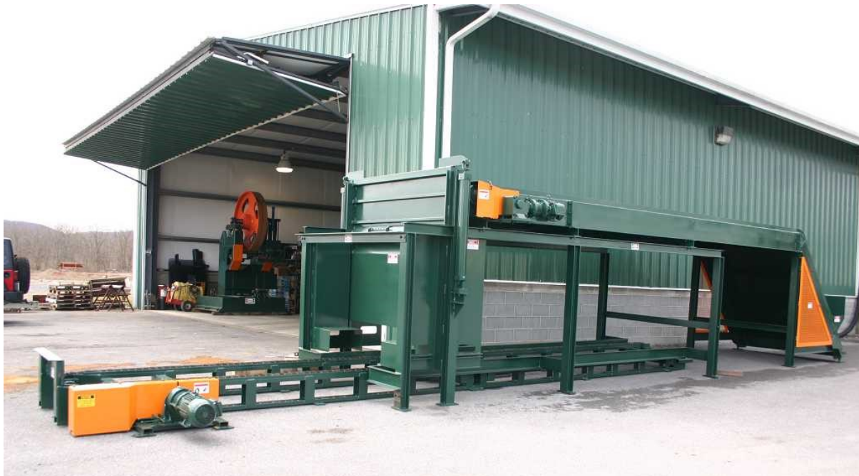
Systems are fully assembled and tested at our factory prior to shipping.