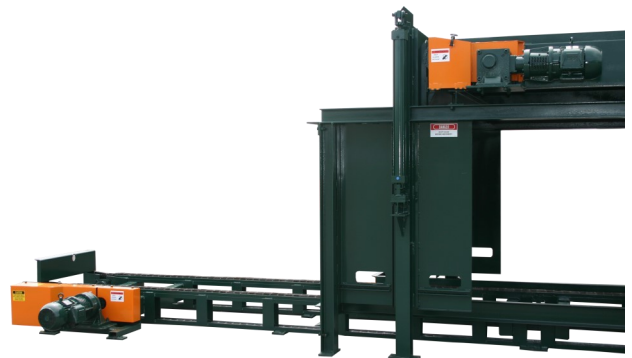
Available with manual or automatic controls

MELLOTT MFG. CO., INC. 13156 Long Lane Mercersburg, PA 17236 Phone: (717) 369-3125 Fax: (717) 369-2800 sales@mellottmfg.com