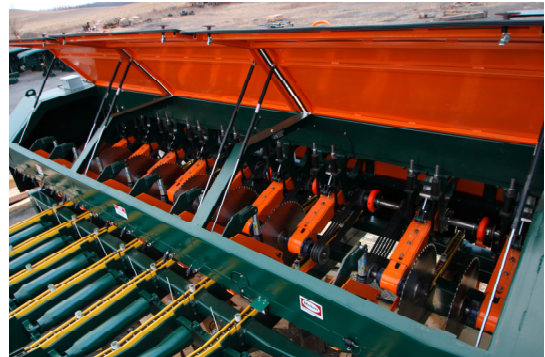
INTERIOR VIEW WITH FRONT HOODS RAISED