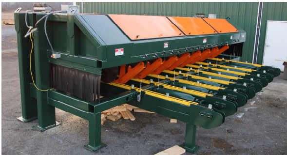
MODULAR CONSTRUCTION, INFEED AND OUTFEED BOLT ON FOR MULTIPLE CONFIGURATIONS INCLUDING PLAIN INFEED, IDLER ROLLS, POWERED ROLLS WITH POSITIONING GATE