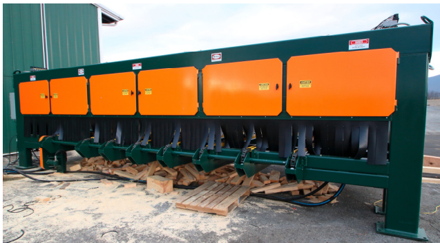
REAR VIEW SHOWING HINGED DOORS