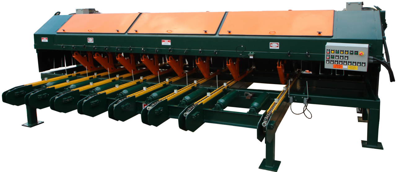
RIGHT HAND DROP SAW TRIMMER WITH MINUS 1' SAW AND EVEN ENDING IDLER ROLLS