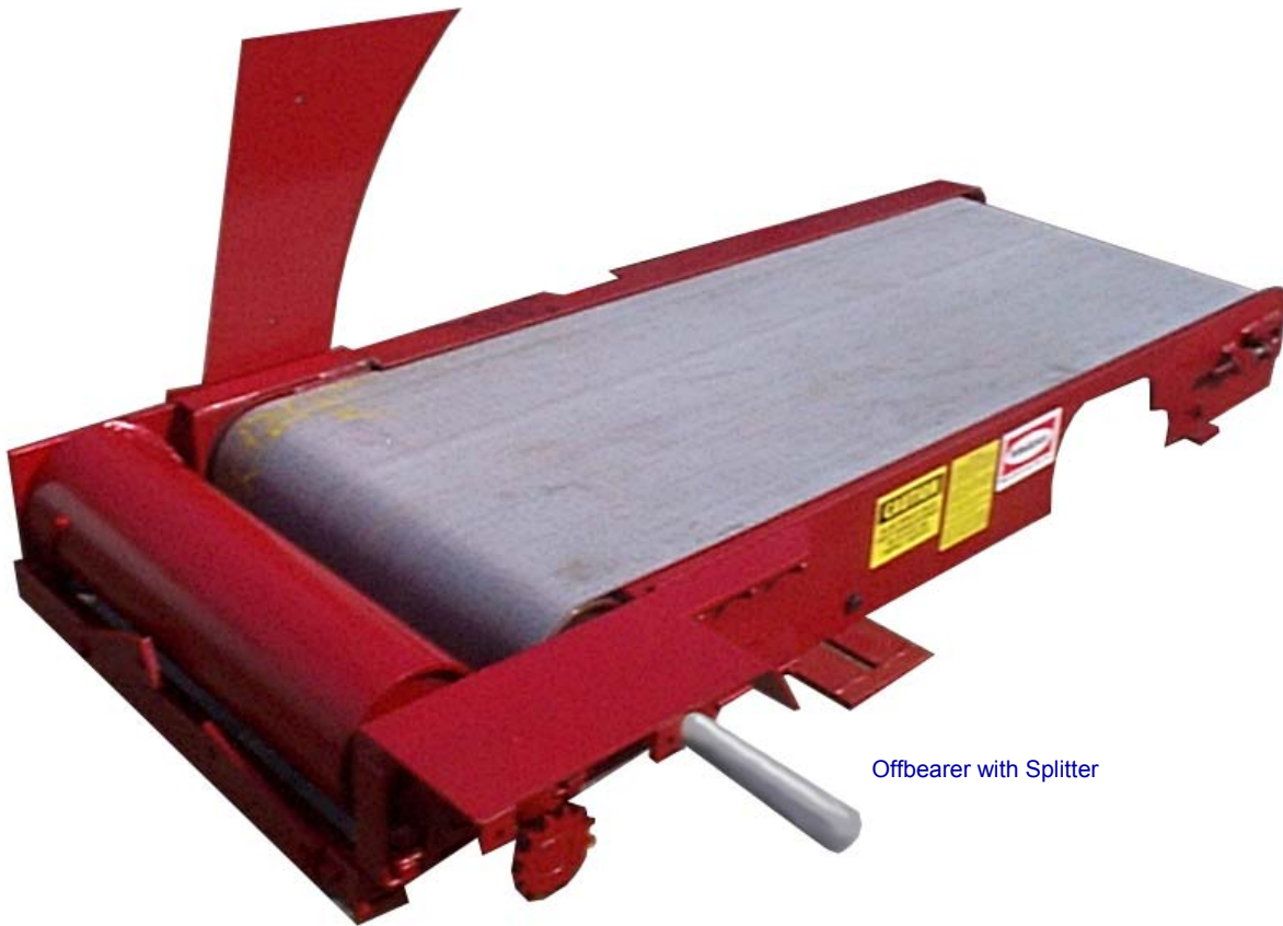
Offbearer with Splitter