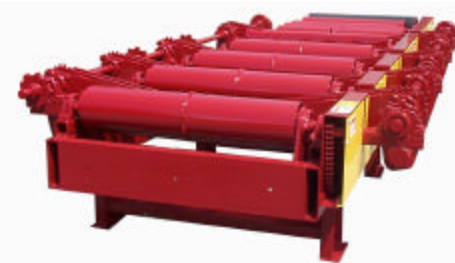
LINE BAR RESAW OUTFEED ROLLCASE