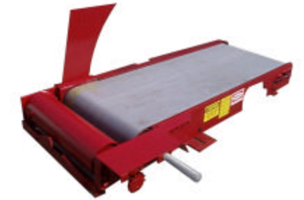
HUSK MOUNTED OFFBEARER