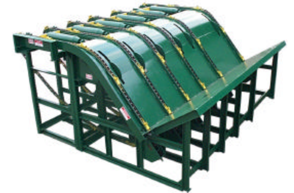
UNSCRAMBLER WITH SINGULATOR AND EVEN- ENDING MODULE