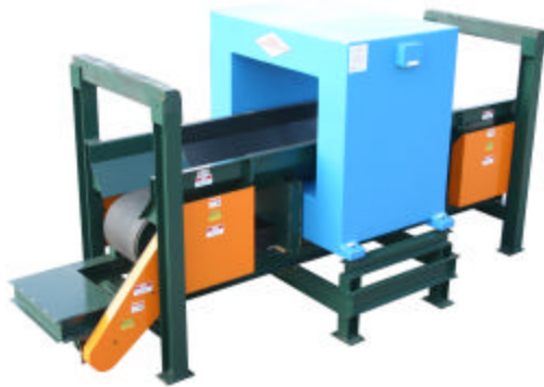
WHOLE LOG METAL DETECTORS