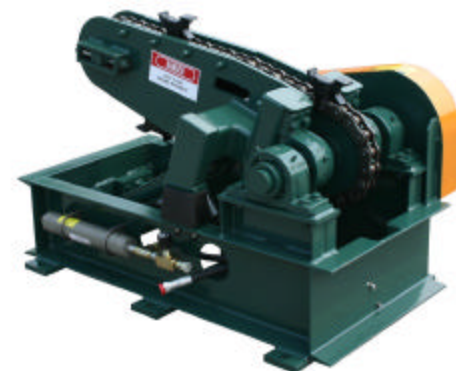
MODEL 8 LOG TURNER