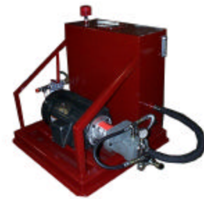
HYDRAULIC POWER PACKS