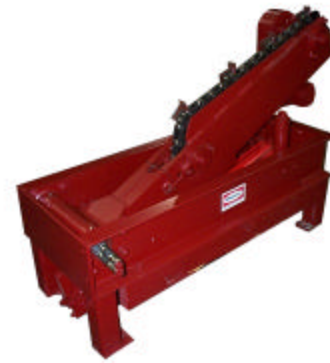
MODEL 5 LOG TURNER