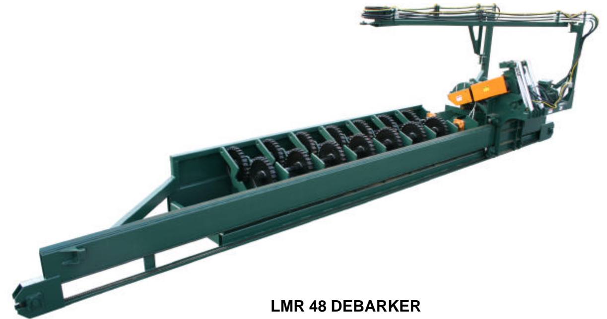
LMR 48 DEBARKER