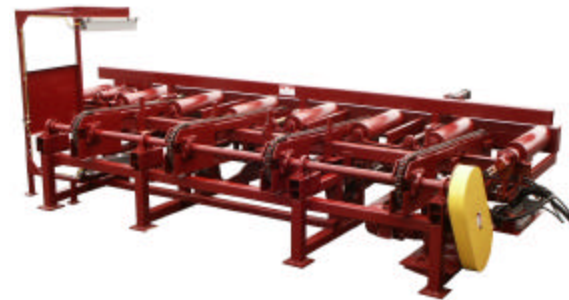
LINE BAR RESAW INFEED ROLLCASE WITH TURNERS/STOPS AND