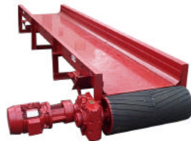
SLAB BELT CONVEYOR

CONTROL PANELS AUTOMATION & MOTOR CONTROLS