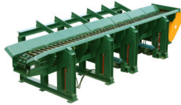
LOG TROUGH CONVEYOR WD120 CHAIN