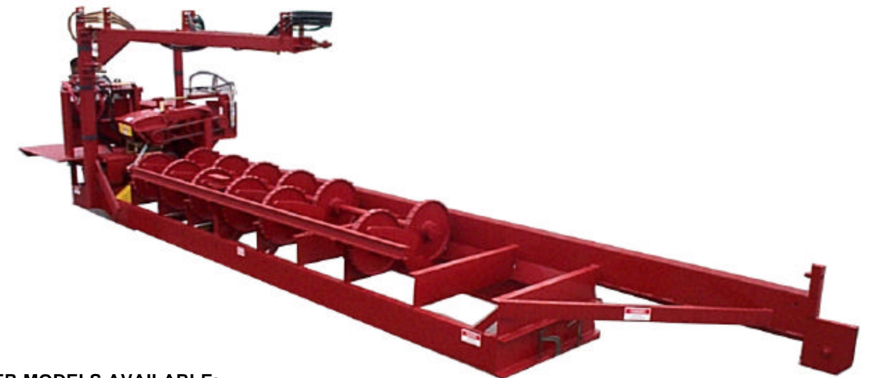
36" HYDRO-ELECTRIC DEBARKER