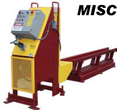
SCRAP SHEAR SYSTEM