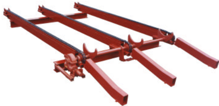
LOG DECKS, STOP & LOADERS