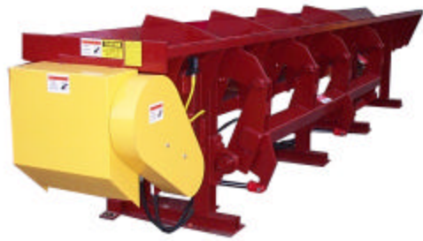
LOG TROUGH CONVEYOR WD110 CHAIN