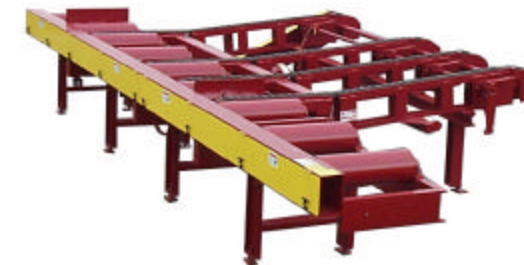
JUMP SKID TRANSFER