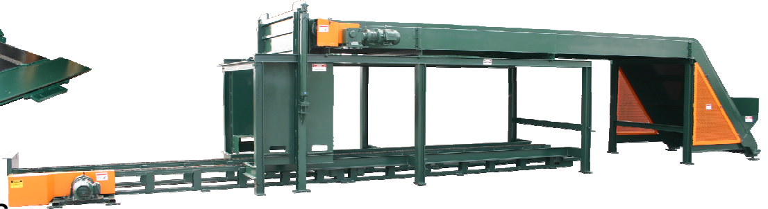
STICK STACKING SYSTEM