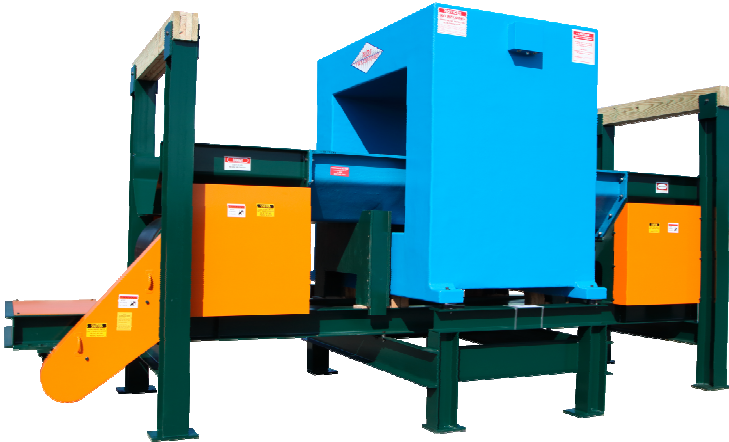
WHOLE LOG METAL DETECTORS