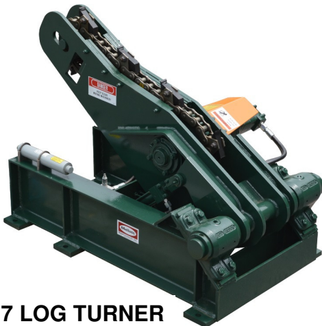
MODEL 7 LOG TURNER