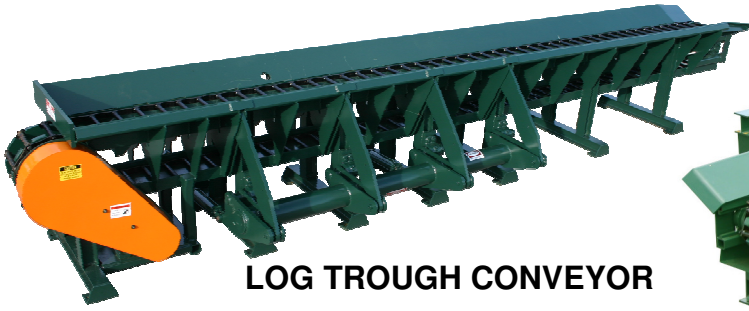
LOG TROUGH CONVEYOR WD110 CHAIN