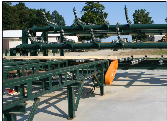
CHAIN TRANSFERS / TIE SORTING SYSTEM