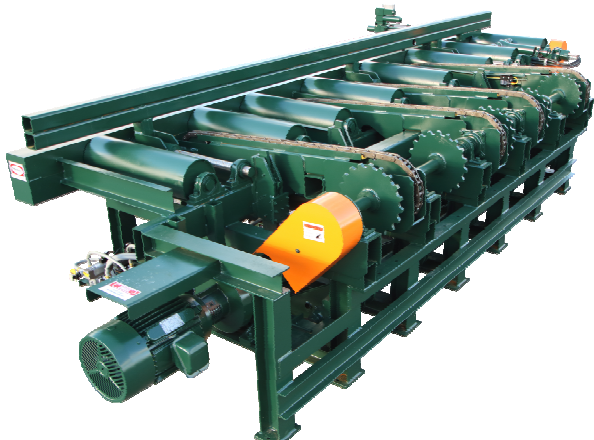
ROLLCASES, RESAW INFEED, OUTFEED, JUMP CHAINS, JUMP SKIDS DUAL PURPOSE KO & TRANSFERS