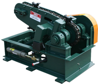
MODEL 8 LOG TURNER