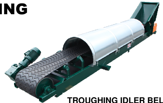
TROUGHING IDLER BELT CONVEYORS