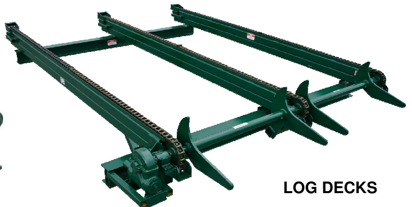
LOG DECKS STOP & LOADERS