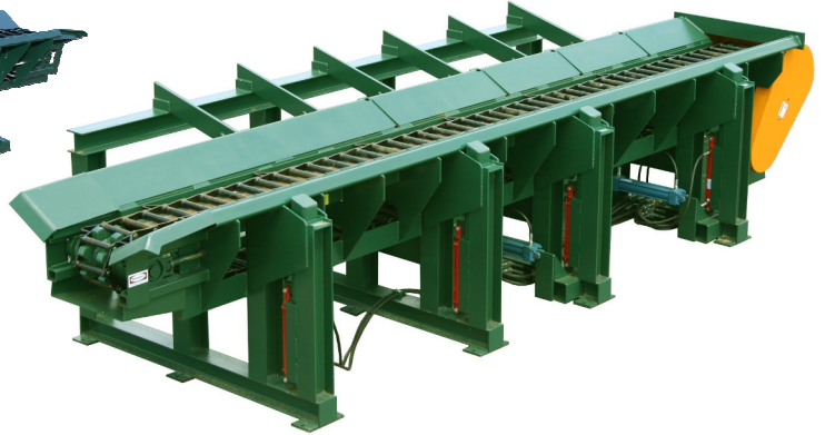
LOG TROUGH CONVEYOR WDH120 CHAIN